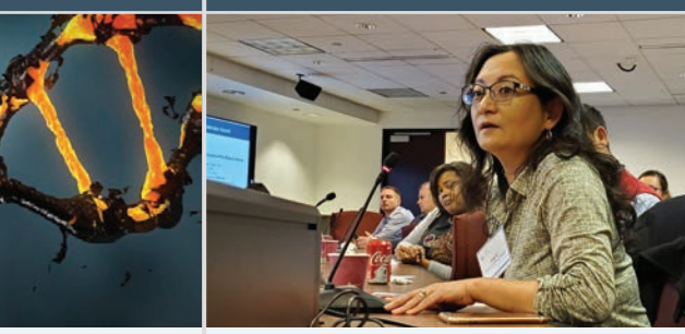
CBC Accelerator Awardee Presentations: "Progress to Date & Pitch for Year 2 funding" at the 5<sup>th</sup> 2019 CBCAN, held at the Discovery Partners Institute.

The CBC is honored to be funded by the Searle Funds at The Chicago Community Trust.